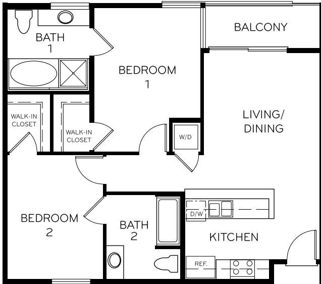
PLAN F 2 Bedroom/2 Bath Approx. 937 s.f.